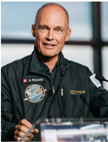
Bertrand Piccard, President of the Solar Impulse Foundation, Minutes of the 2022 General Assembly of the World Alliance for Efficient Solutions

As we reflect on the past year, we can't help but feel grateful for the progress that we have made together as a community. We have now a total of 1500 clean and profitable solutions available in our database, and have presented them to governments, business leaders and media through a big variety of events. By assisting policy makers in adapting outdated norms and standards, we can bring to market the clean and efficient solutions needed to protect the environment, reduce waste and thus improve purchasing power.