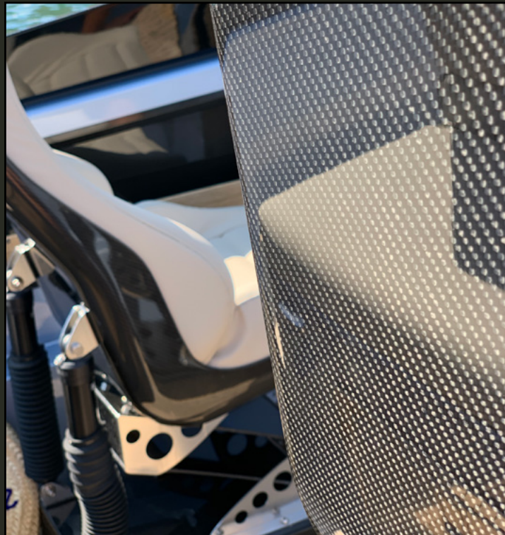
SAY-experiences at its finest: Eye-catching visible carbon parts