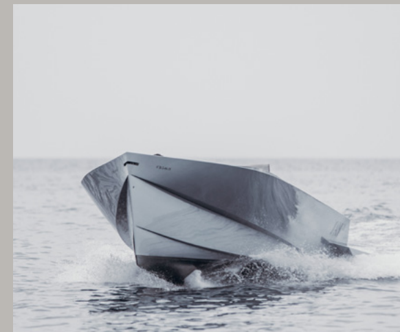
SAY Carbon Yachts designed an unique “wave cutting” bow.

SAY Carbon Yachts constructs stylish powerboats with hulls made of 100% carbon fibre. This makes all vessels fast, solid and economical. SAY uses reliable standard fibres from classes T300 and T700 with individual layer weights between 200 and 800 grams. Thanks to this it allows sports car-like acceleration.