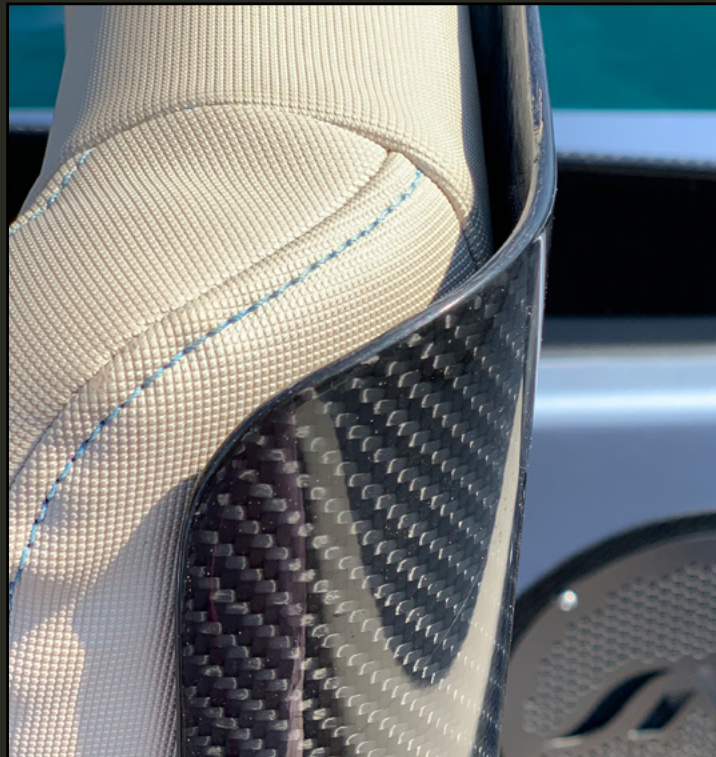
Passion for details: Luxurious materials on deck