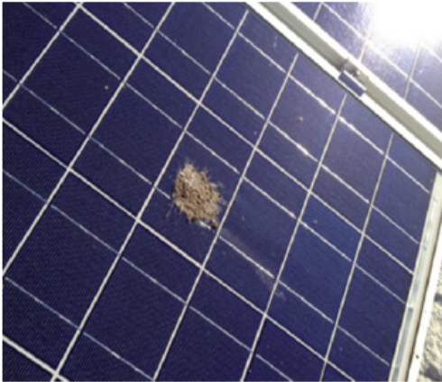
Figure 2: An example of the presence of bird's excrement.

However, it should be considered that, because of the presence of deposited material above the panel an increase in the probability of panel's failure or damage also occurs. As an example, when a PV panel is covered either by dust or by foliage or by birds' excrements (see Figure 2) a localized overheating and the Joule effect occur. This could determine the initiation of localized fire of the panel. Such a phenomenon is known as a Hot-Spot phenomenon.