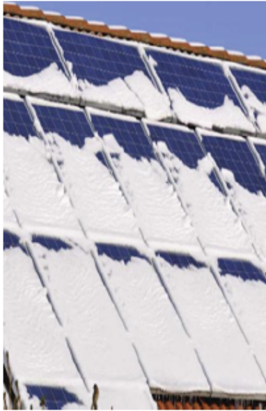
Figure 4: An example of the presence of snow covering.

damage. This last aspect is especially important for guaranteeing safety conditions both during installation operations and during incidental events (as an example during the panel's fire event). In particular, the major problem occurring both during the panel's installation operations and during a fire is related to the fact that the solar panel is powered directly by the sun generating Direct Current (DC) (see Figure 1) which cannot be switched off. Thus, because of the current running through the PV panel and the connected electric line, a risk of electrocution for who may accidentally come into contact with them exists. This can particularly result in problematic situations for firefighters and operators during a fire event, as highlighted by the media especially in the last few years.