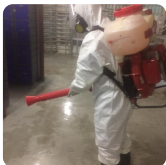
Malaria, Pest and Covid 19 control services