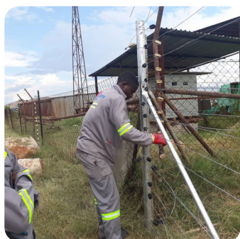
Electric Fencing Services