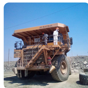
Supply of mining chemicals