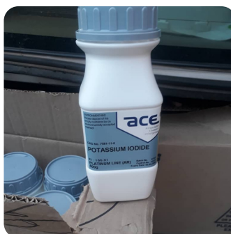
Supply of Agro chemicals