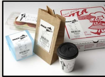
Food Delivery & Pickup