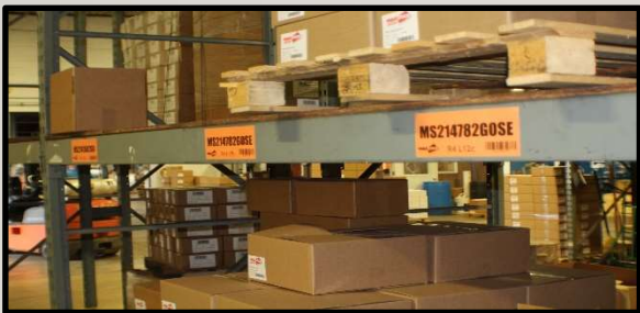
Warehouse & Inventory Control