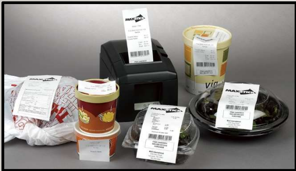
Quick Serve Food Preparation

Originally designed for the food service industry, MAXStick® quickly found applications in many unrelated industries.