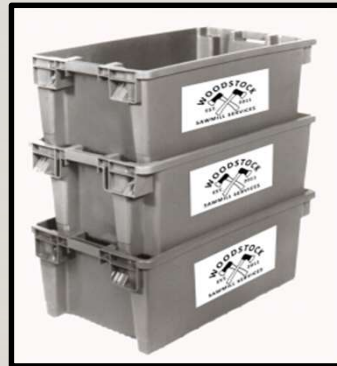
Reusable Container Labeling