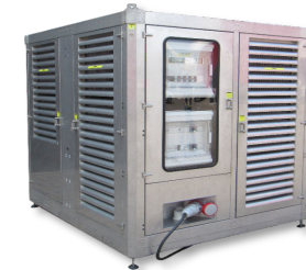
Air to Water Generator