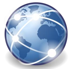
International Collaboration Multi-disciplinary international consultants and advisors spanning the ICT, Energy, Transportation, Health, Education, Agriculture, Industry, eGovernment & Finance sectors.