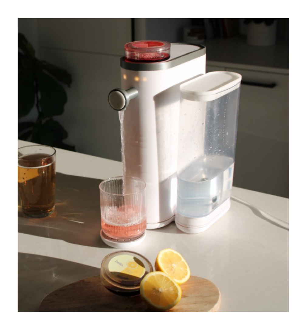
Bello Home creates personalized water at home. Bello combines advanced water purification and precise infusion using pods of concentrate, in order to offer an outstanding and tasteful experience to the user.

Infuses water with natural flavors, real juices and minerals