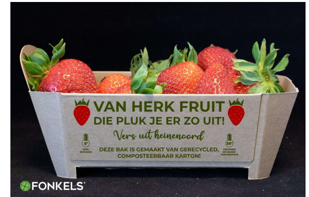
Strawberry tray developed in close cooperation with van Herk - A TOP 250 - 400 - 500 gram