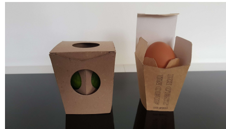
Protective packaging for a single vulnerable product https://www.atoppackaging.com/protective-pack