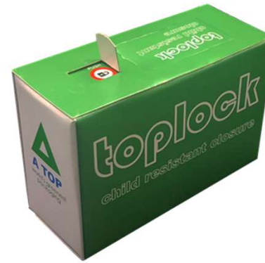
Box with a tamper evident and childproof closure. https://www.atoppackaging.com/other-1