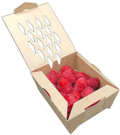
Raspberry tray 150 en 300 gram

Hygienic and food-safe with or without lid