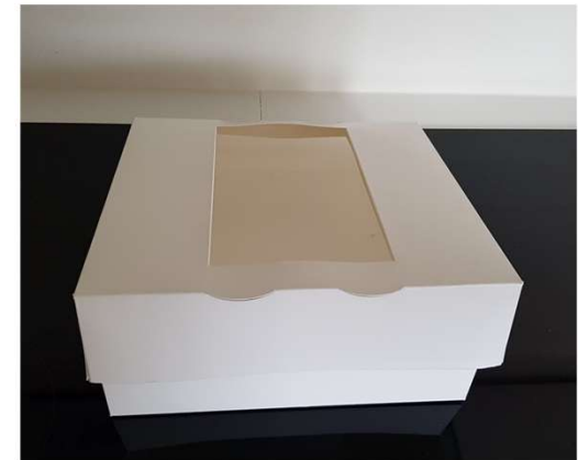
Coming soon Pastry- or catering box Window is not glued Ready for 2025 and the targets set by EU en Plastic Pact NL/EU