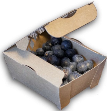
Berry box 150 en 300gram