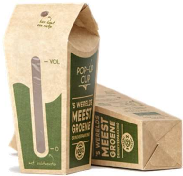
Replacement of plastic and paper cups (plus lids). For cold drinks, soda's, smoothies, shakes, juices and more. https://www.atoppackaging.com/pop-up-cup