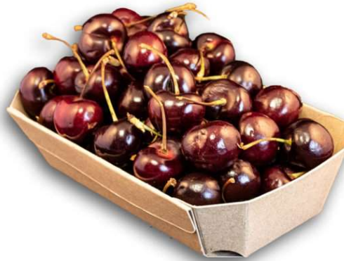
Chery tray 500 en 1000 gram