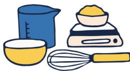
Formulation from A to Z