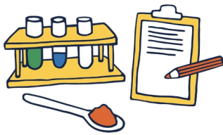
Development of ingredients